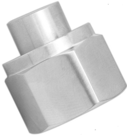
Dimensional Details :